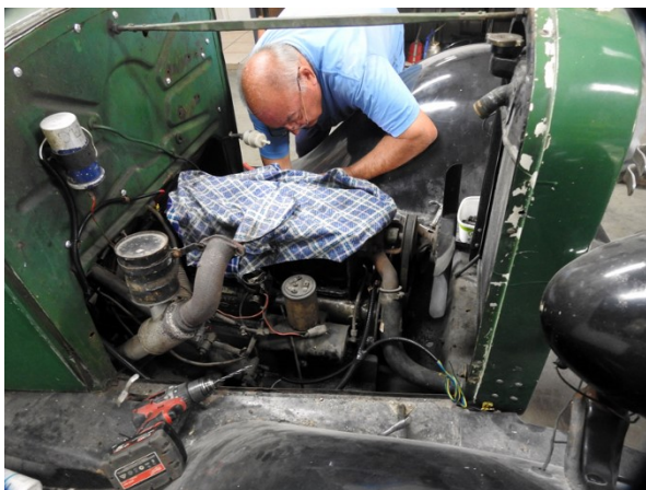
Replacement of wires and battery in a 1927 Chevrolet.