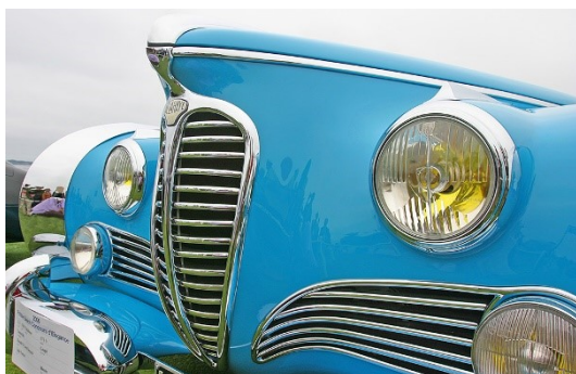
1949 Delahaye front

Saoutchik was commissioned by flamboyant English collector, Sir John Gaul to produce a one-off work-of-art. The design was based on the 1st post-war 175 S Roadster chassis, using a 4,455cc naturally aspirated overhead valve inline 6 cylinder engine producing 165BHP, an engine much larger than pre-war. Three Solex 40-Aip carburetors, and a 4 speed electro-mechanically actuated Cotal Preselector gearbox, Dubonnet coil spring front suspension, De Dion rear axle with semi-elliptic springs and 4-wheel hydraulic finned alloy drum brakes. The wheelbase was 116 inches. Inside, the 2 toned interior was busy and featured a combination of designs that worked together in their excess. The rows of knobs and the steering wheel made from see-through Lucite were unique. A radio and heater were a novelty. Much of this Delahaye's beauty is the heavy use of chrome accents that highlighted the curves. Most dramatic and arguably beautiful of all the supercars