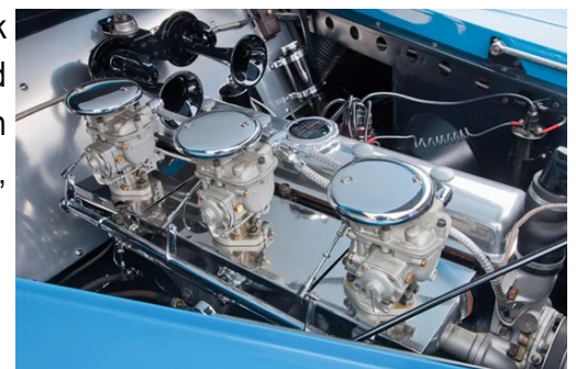
Three Solex 40-Aip carburetors

is this 2 seat Roadster, Saoutchik conveys a sense of drama and movement with the design. With the completely enclosed wheels, the cars best angle is its profile.