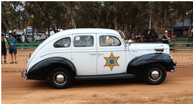
1940 Ford Delux - owner Lance Glew