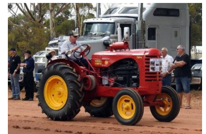
Interesting entries in the Grand Parade