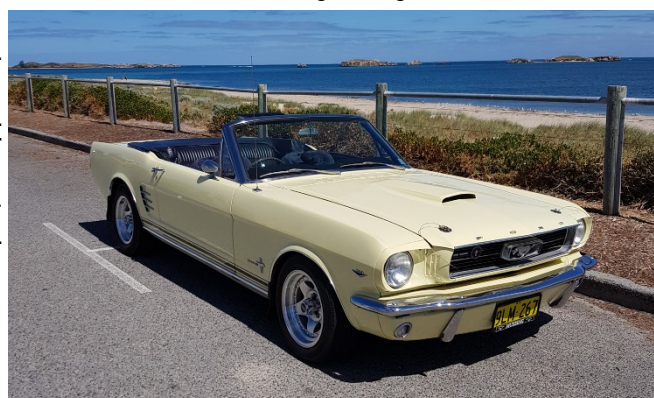
1966 Mustang convertible Looking across to Penguin Island Shoalwater Bay