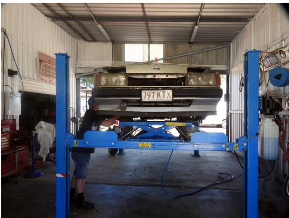
Repairs to a Falcon Sedan on the car hoist.