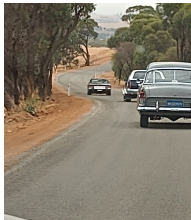
We hit the road to drive in convoy through the picturesque forest and farmland to Brookton