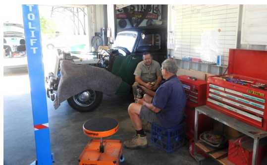
Well earned cold beer after Saturday morning hard work in the workshops of the VAA Club.