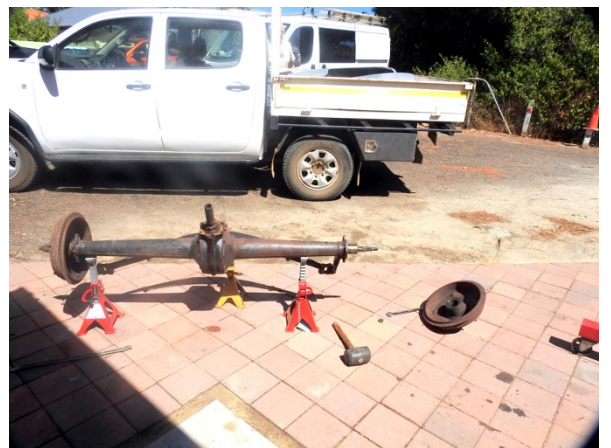
Axle from a Ford 1930 model, ready for dismantling.