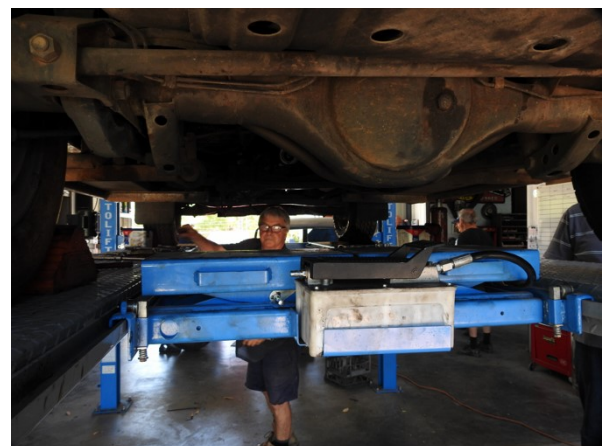
Service to a 4x4. Oil and filter change + adjustments to various things.